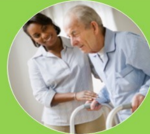
CERTIFIED HOME HEALTH AIDE