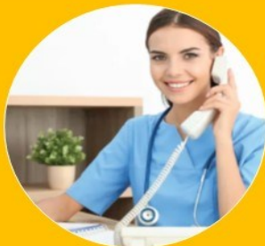
CERTIFIED MEDICAL ADMINISTRATIVE ASSISTANT