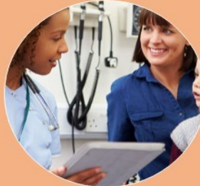
CERTIFIED CLINICAL MEDICAL ASSISTANT